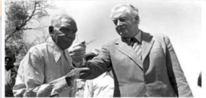
Image 14: Gough Whitlam gave the Gurindji people their victory.